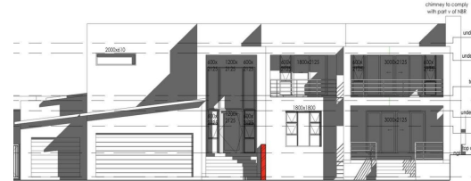
DRTH ELEVATION ale 1:100