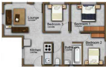
55m 2 3 bedroom 1 1/2 bathroom

50m 2 R 410 000.00 20 R 4 375.00 R 14 500.00