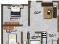
50m 2 2 bedroom 1 1/2 bathroom

45m 2 R 380 000.00 20 R 4 055.00 R 13 500.00