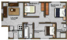
60m 2 3 bedroom 2 bathroom

55 m 2 R 430 000.00 20 R 4 590.00 R 15 250.00