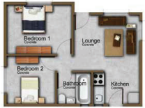
45m 2 2 bedroom 1 bathroom