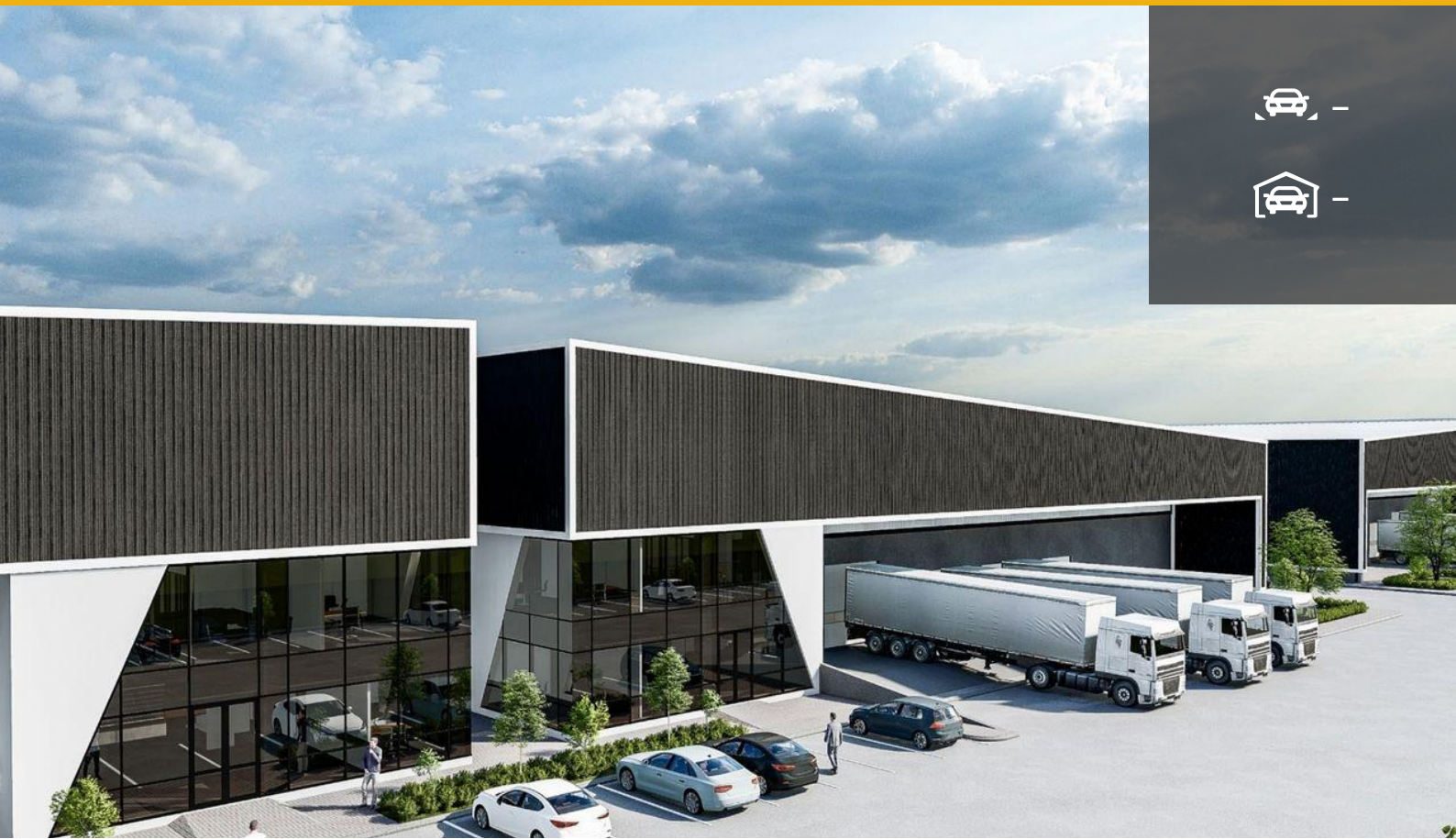
KL Development - Witfontein X 97