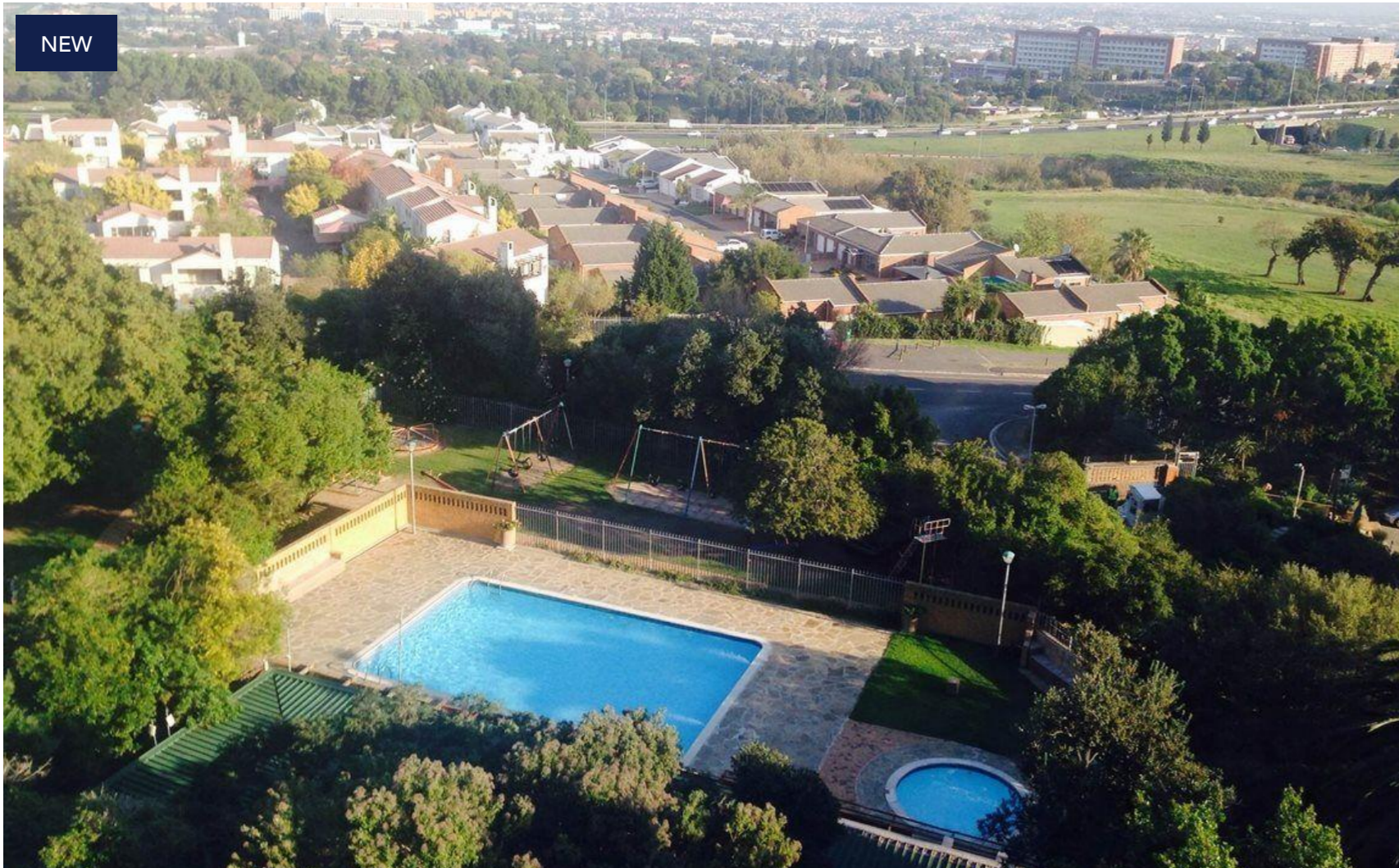
Table Mountain Sunset views!

Sole Mandate. Situated in the popular and meticulously managed Tafelsee complex, residents enjoy access to a sparkling pool, 24-hour on-site security, a playground, and a braai area for entertaining. Upon entering this lovely 2-bedroom apartment, the stunning parquet flooring sets a sophisticated tone. Notably, the apartment features an advanced inverter system with 8 batteries, ensuring an uninterrupted power supply for ultimate convenience. The open-plan layout seamlessly connects the lounge with the kitchen, creating an inviting space for relaxation and entertainment. Large windows offer panoramic views of Table Mountain, bathing the lounge in natural light.