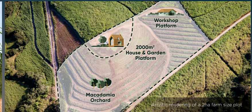
Artistic rendering of a 2ha farm size plot