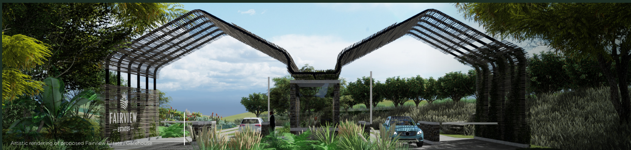
Artistic rendering of proposed Fairview Estates Gatehouse

D176, Compensation Ballitoville, 4390 KwaZulu-Natal South Africa