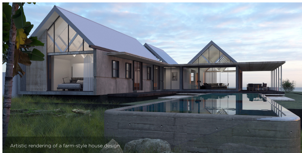
Artistic rendering of a farm-style house design

If space and independence are important to you, Fairview Estates is the place for you.